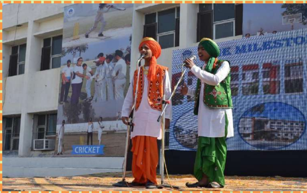
FOLK SONG (JUGNI)