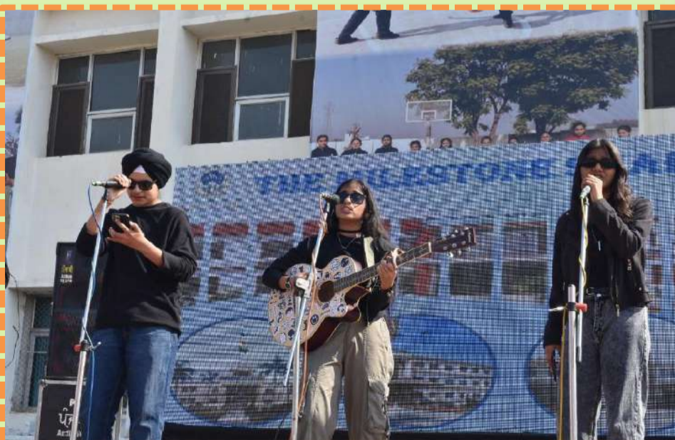
ENGLISH GROUP SONG (BEGGIN)