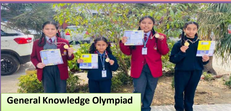
General Knowledge Olympiad