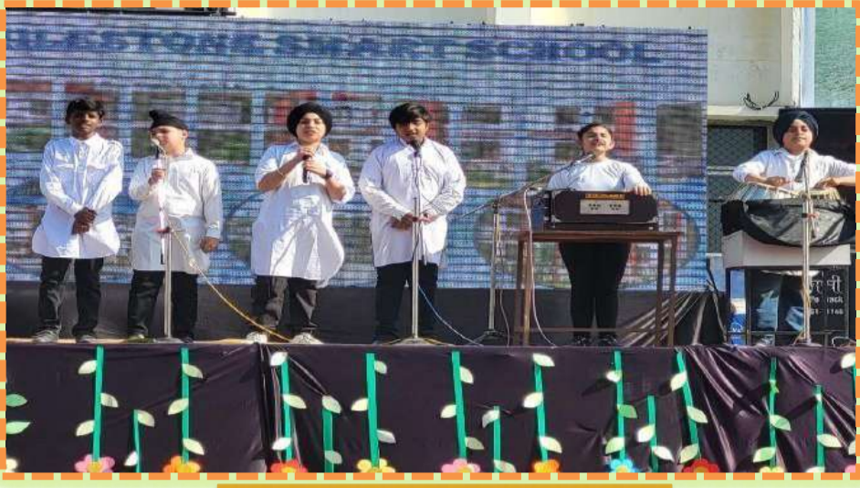
FOLK SONG (RUTBA)