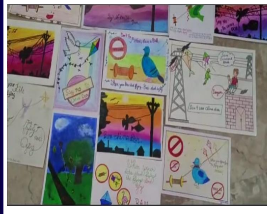
Ban China Dor : Poster Making