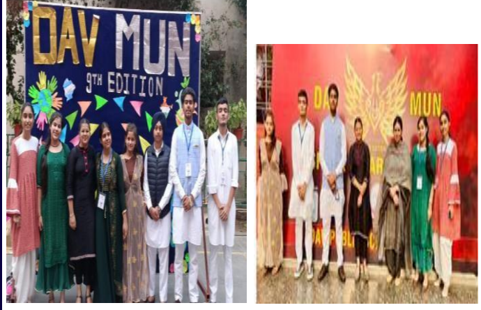
Students participated in MUN at YPS and DAV, Patiala

4X400m relay (Bronze) 4.Manmeet(XA)- 4X100m relay( Silver) 4X400m relay(Bronze) at District Level.