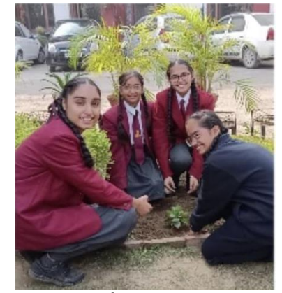
Van Mahotsav Drive