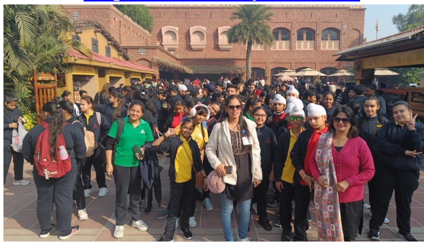
TMSS News: November, 2022

An Edutainment trip to PushpaGujral Science City, Jalandhar was organized wherein the students of classes VI - X enjoyed thoroughly.