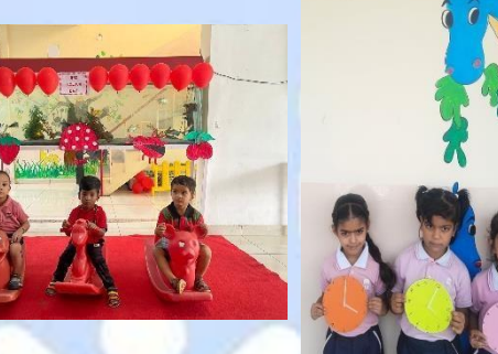
How Lovely Yellow Is !