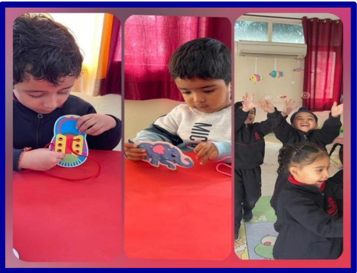
"Gifts of Time and Love are surely the basic ingredients of a truly Merry Christmas"