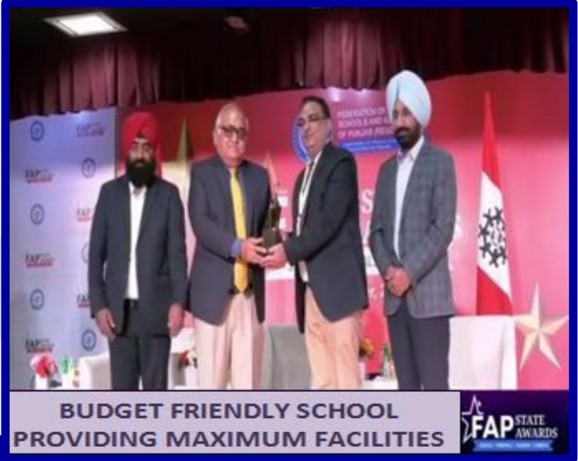
BUDGET FRIENDLY SCHOOL PROVIDING MAXIMUM FACILITIES